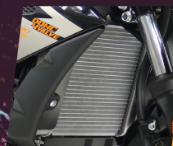
Liquid Cooled System.