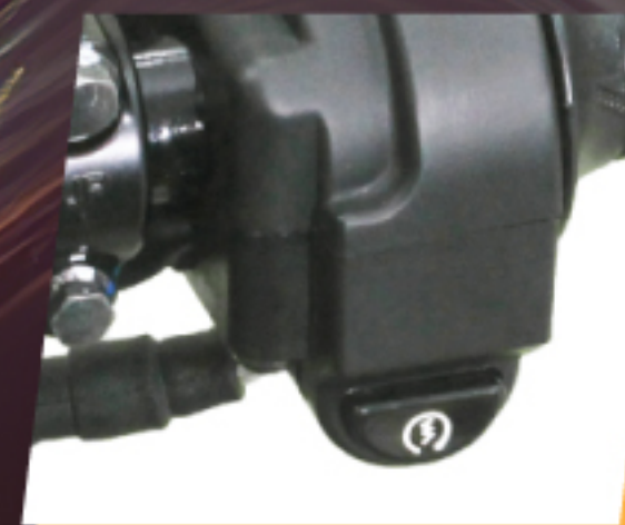
Suzuki Easy Start System.