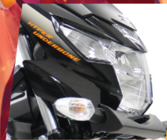
Aggressive LED Headlamp.