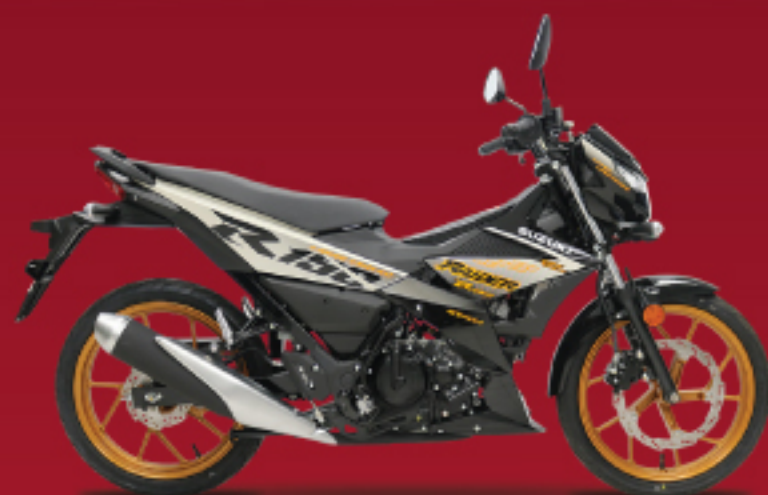
Bright Ivory / Titan Black (B87)