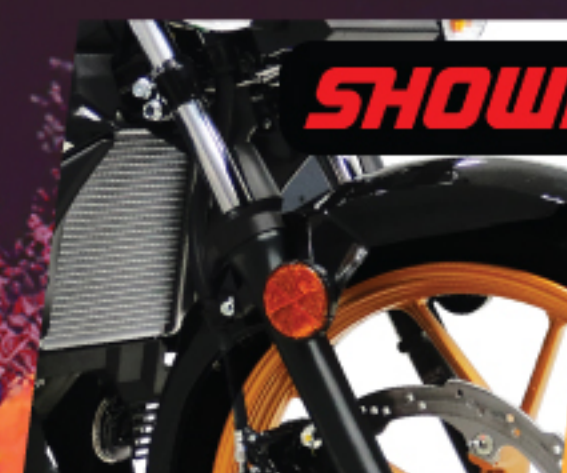
Long Telescopic Front Forks.