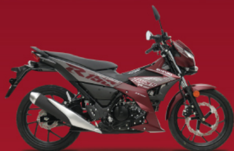
Matte Bordeaux Red / Metallic Matte Fibroin Grey (CAV)