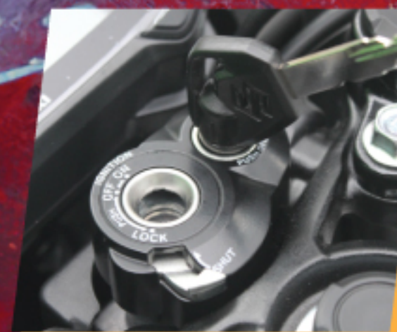
Shutter Key System.