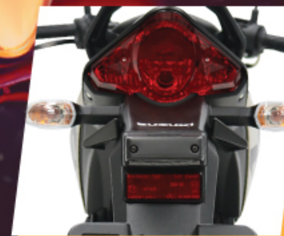
Tail Light And LED License Plate Light.