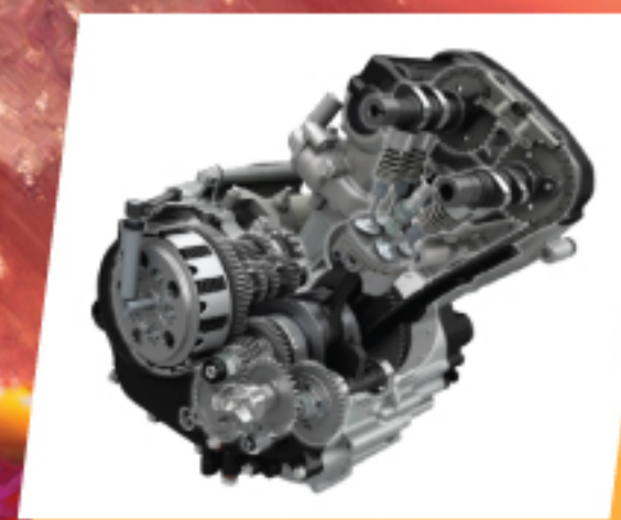
4-Stroke, DOHC, 4-Valve, 6-SPEED.